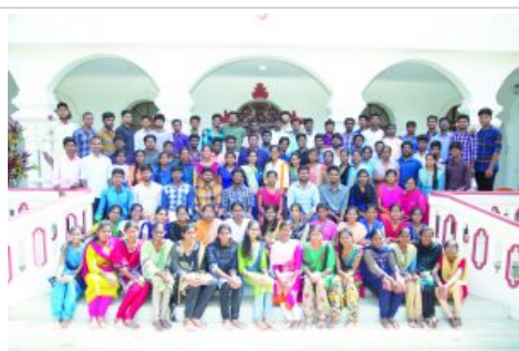
Students of Mugavari Foundation at Porur.